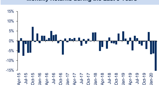
Monthly Returns during the Last 5 Years